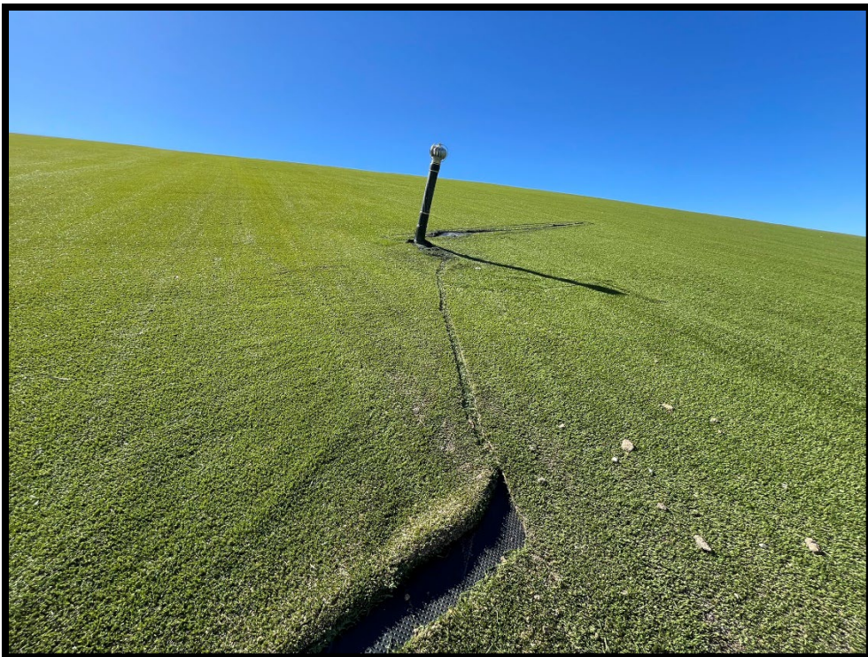
Photograph 4: View of damaged closure turf on the north side of Area 1-2.