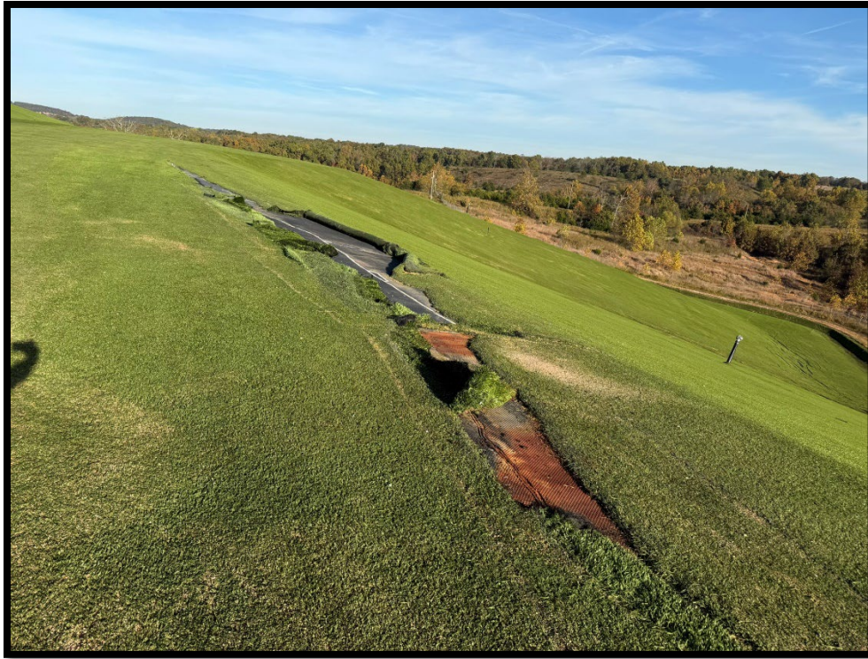
Photograph 5: View of damaged closure turf on east side of Area 1-3.