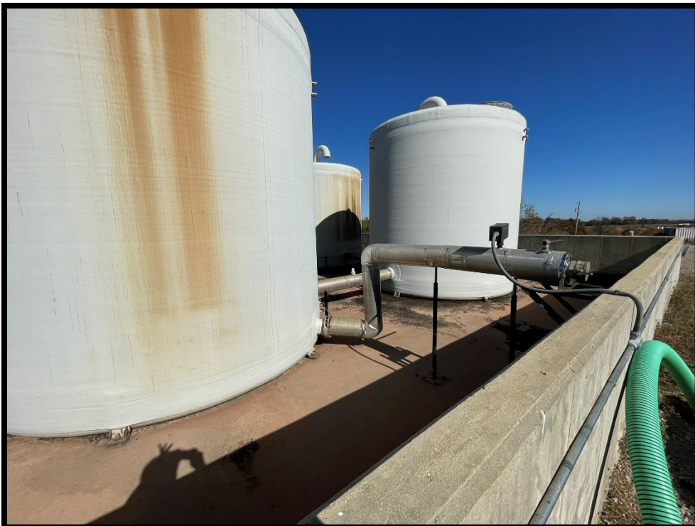
Photograph 2: View of empty secondary containment at leachate tank battery.