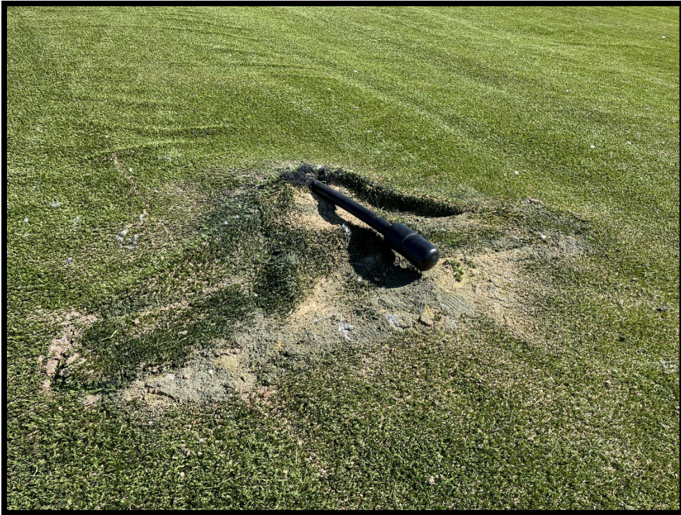
Photograph 3: View of damaged pressure relief vent on west side of Area 1-2.