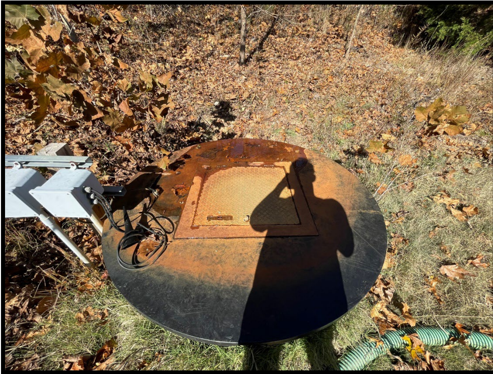
Photograph 1: View of VLCS-1 at capacity and overflowing.